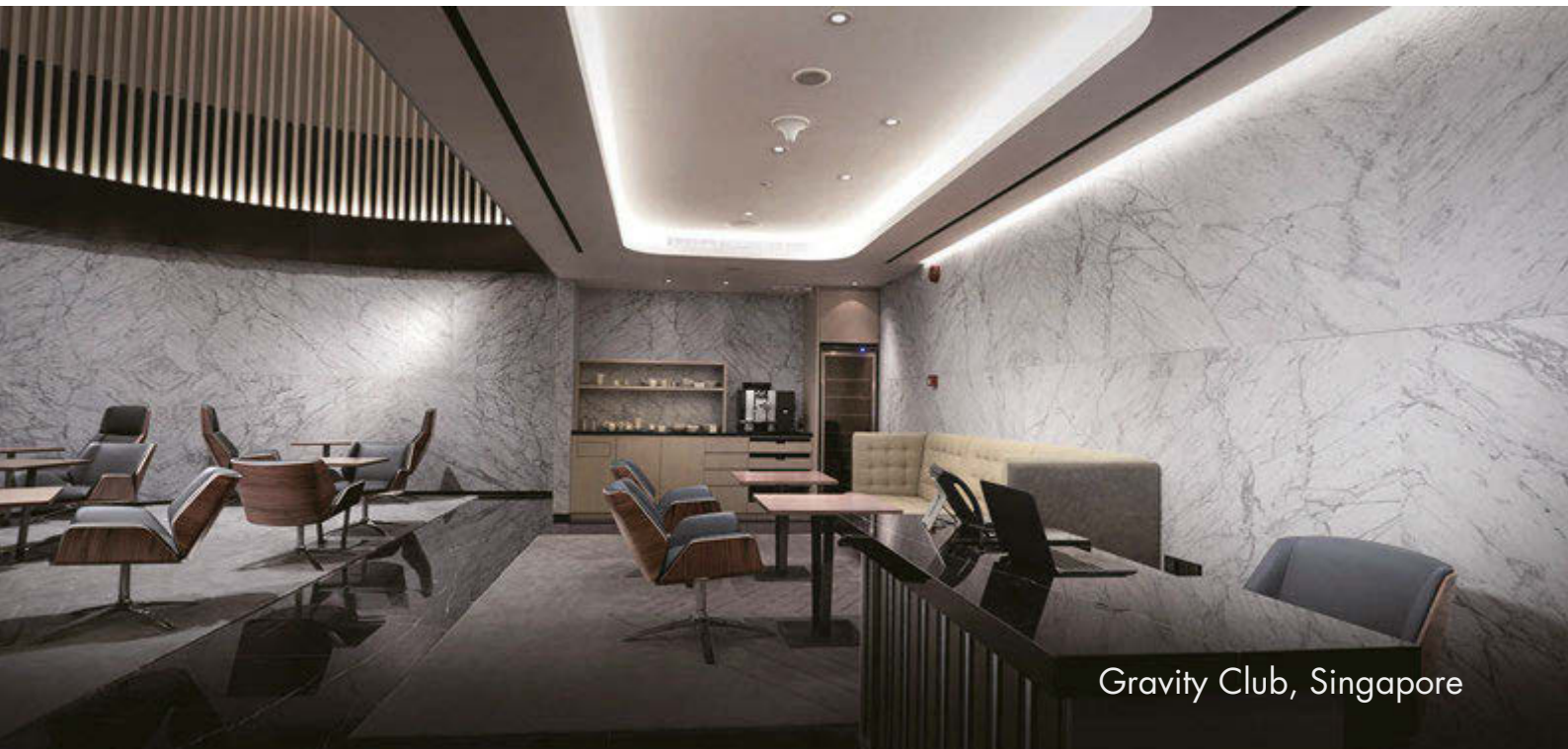
Gravity Club, Singapore