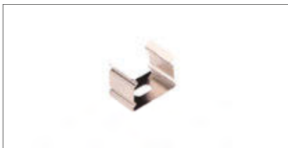
Mounting Bracket M00055